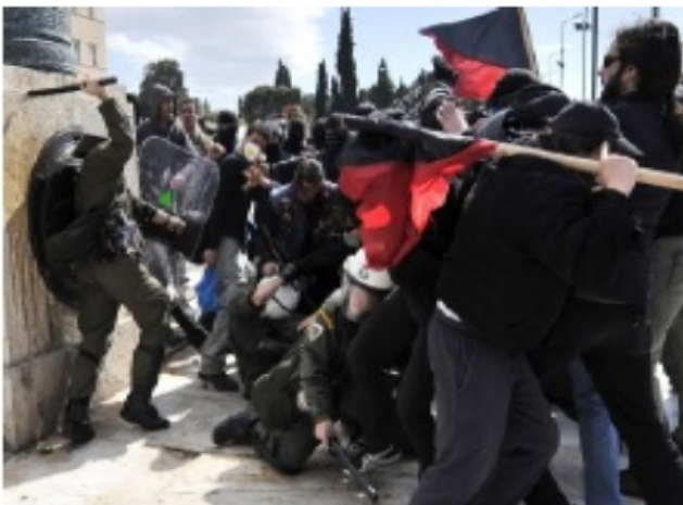
A common sight

The fascist's -Golden Dawn- legitimate entry into Parliament with 7% of the ballot using an anti-immigration campaign and taking advantage of the Greek economic crisis should be of great concern to the anarchist movement. With the support of the police they have launched a terror campaign, the latest atrocity being the murder of a young Iraqi stabbed by a group of 5 nazis with no arrests being made to date. The modus operandi is the same as in the dozens of attacks committed in recent months against immigrants not only in Greece but in many other European countries.